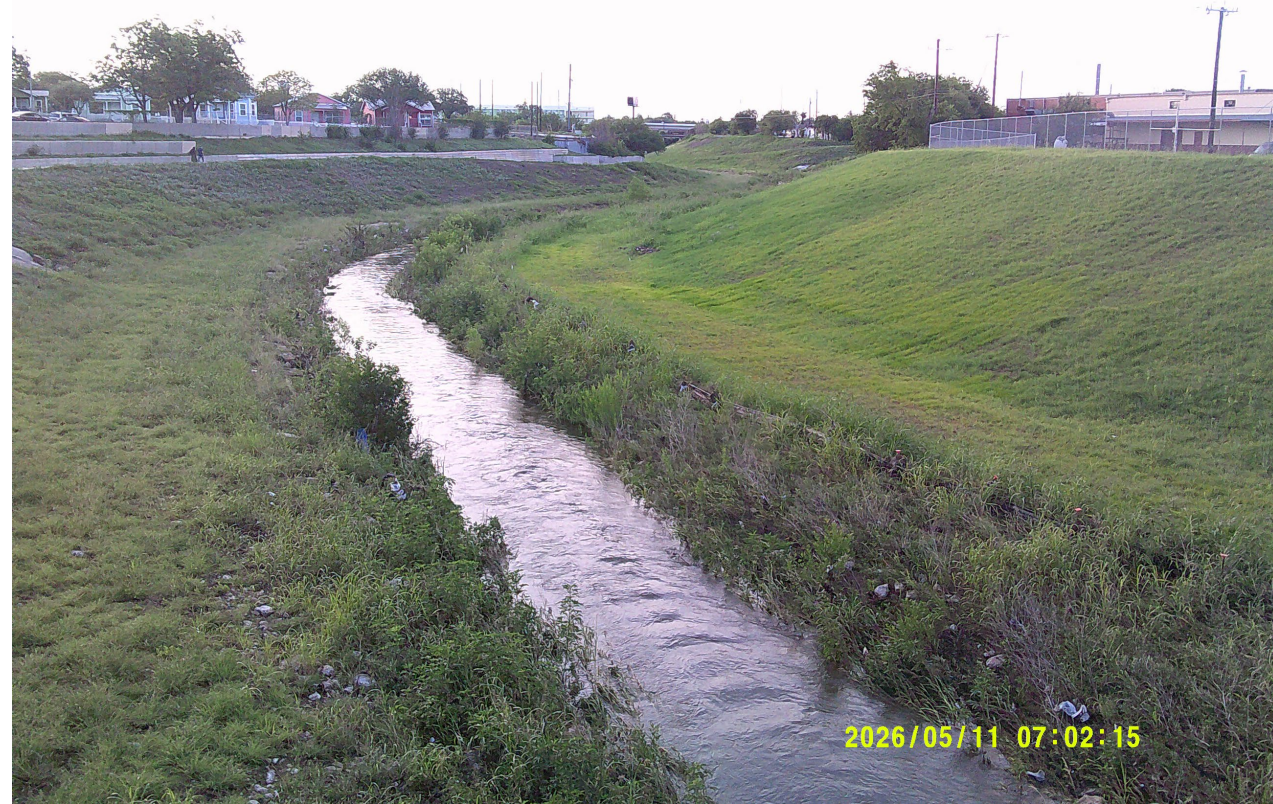
Apache Creek Looking East