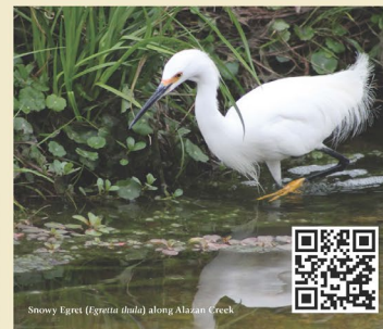
Snowy Egret ( Egretta thula ) along Alazan Creek.