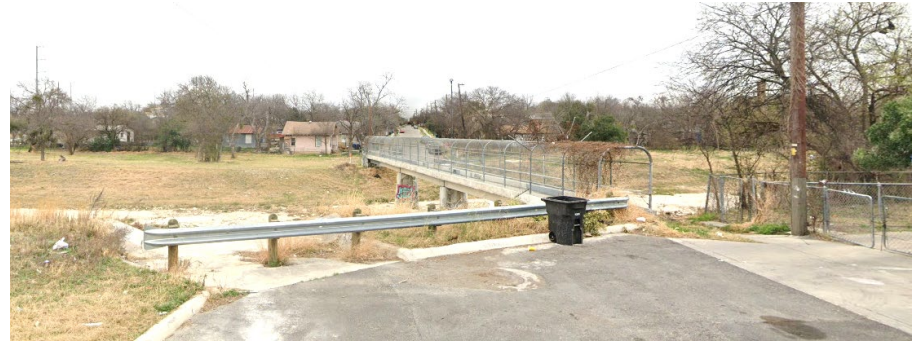
Existing Arbor Pl. Pedestrian Bridge