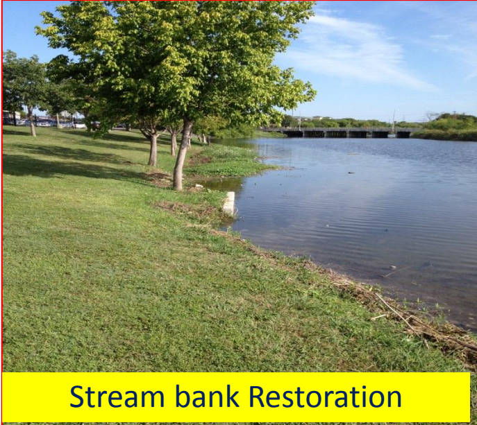
Stream bank Restoration